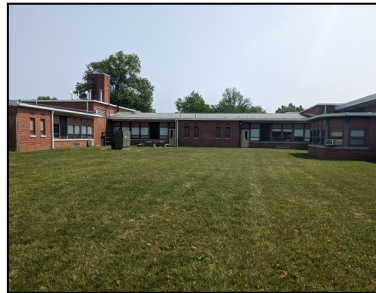
Future site of Wilmington Manor E. S. garden

Earth Day Celebration, the UD Ag Day event, the Bellevue Farms Seed Swap, and a live interview on the DE TV Good Morning Wilmington program.