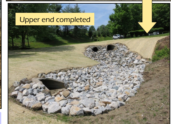
Upper end completed

An upper and lower section of a severely eroding channel in Berkshire off Limestone Road was repaired by re-grading the channel and lining with riprap, a stone used for erosion control. A drainage system was installed behind a section of townhomes and directed to a protected outlet down the slope behind the affected homes.