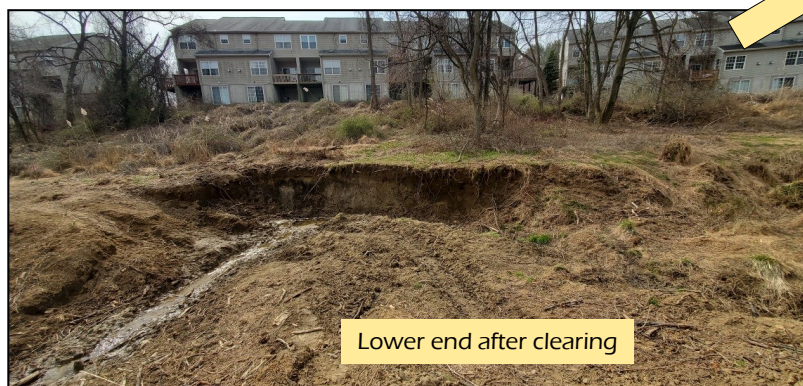
Lower end after clearing