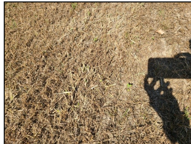
L to R: cover crop, pasture re-seeding underway and edge of driveway underdrain system