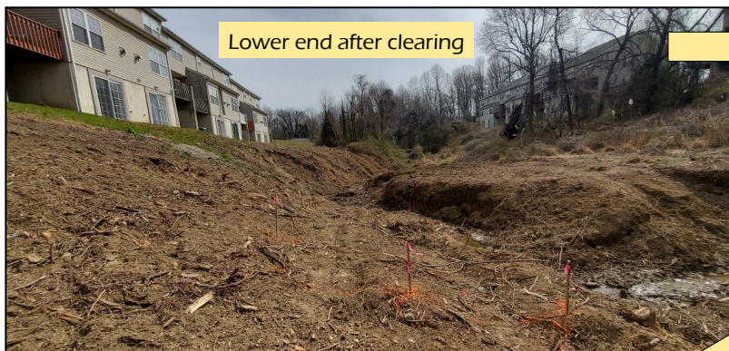
Lower end after clearing

Left to right: A deteriorating timber wall was replaced with a new concrete wall in the community of Drummond Ridge. For landowners in Westover Chase, an existing drainage way was improved with a catch basin and the swale lined with riprap, a type of stone used for erosion control.