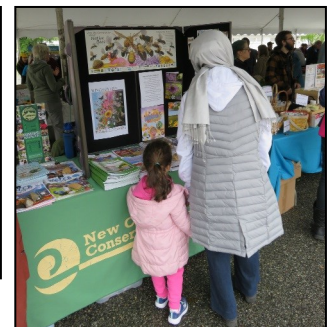
District display at Ag Day