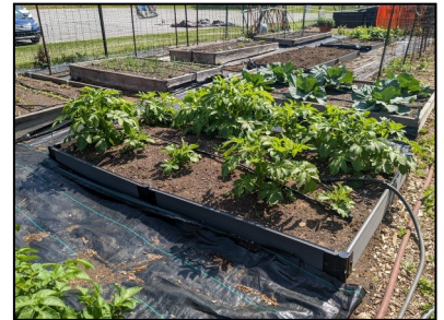
New beds at Resurrection Parish