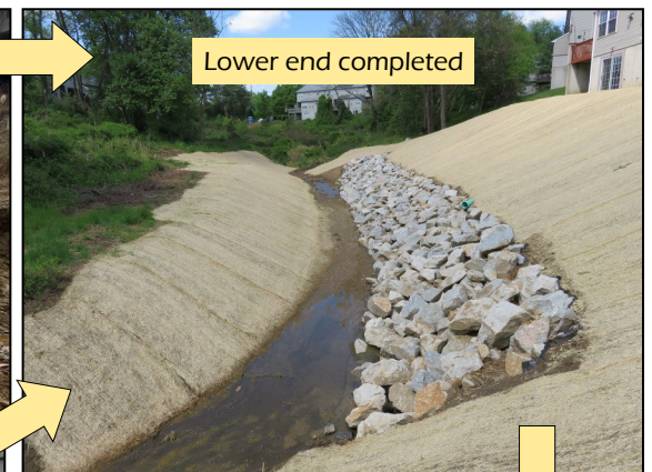
Lower end completed