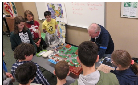
NCC 4-H Science Day Camp Activity