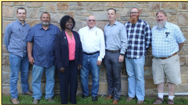
NCCD Board of Supervisors left to right:

The New Castle Conservation District is an equal opportunity employer and provider.