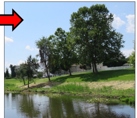
An embankment behind homes in Colton Meadows backing up to the stormwater pond was cleared of vegetation and some spots stabilized with riprap to enable the HOA to begin regular maintenance to maintain visual views to the pond.