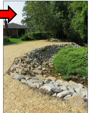
An eroding urban channel in the development of Maplecrest was cleared of vegetation, re-graded and stabilized with riprap.