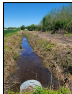
Mowed tax ditch ROW

District staff provided technical assistance with drainage issues to 138 landowners for calendar year 2022. With compacted clay soils many landowners experience soggy yards due to flow from roof downspouts and gushing basement sump pumps. The survey crew provided technical information and construction layout for 54 projects. The District handles Sediment and Stormwater Program requests for 10 municipalities in New Castle County. Assistance is provided to the 26 tax ditch groups in New Castle County.