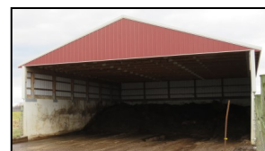
Manure storage structure

have implemented a number of conservation practices including a manure storage structure and a heavy use concrete pad for manure management and many others.