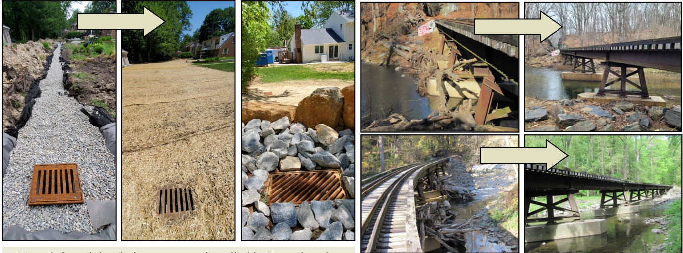
From left to right: drainage system installed in Penarth and a drainage project below a church parking lot off Foulk Road to an adjacent house lot in Chatham.

95 projects were started with 79 projects completed in calendar year 2022. They ranged from small back-yard drainage projects to a few larger projects costing hundreds of thousands of dollars. RC&D projects are funded in coordination with State Senators and Representatives from New Castle County.