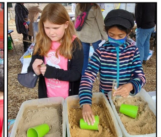
Make A Splash event and Newark CCA Earth Day event