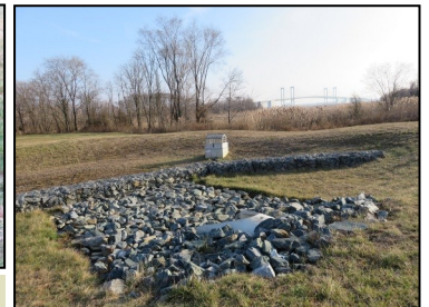
Stormwater pond behind a warehouse in a New Castle area industrial Park.