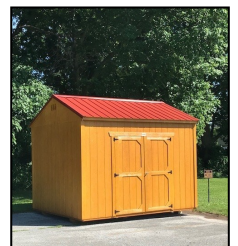
New tool storage shed for a community garden near Newark