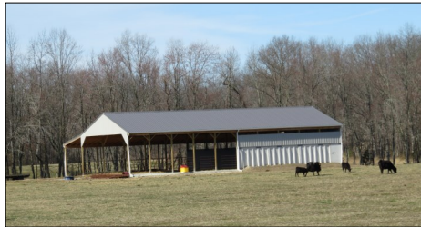
Animal waste structure

Funding provided through the Environmental Quality Incentive Program (EQIP)/Agricultural Management Assistance (AMA) is used for implementing water, air, soil, energy, and plant quality practices. The following practices were implemented during 2022: