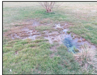
Sump discharge causing ponding, soggy conditions in a residential backyard off Old Baltimore Pike.