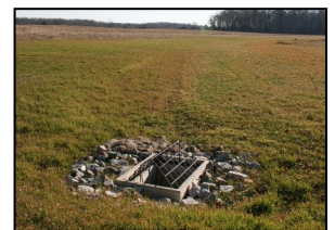
Grassed waterway into a drainage structure