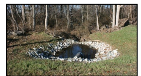
Protected field outlet

local schools, petting zoos, and other events. Congratulations on this well deserved honor!