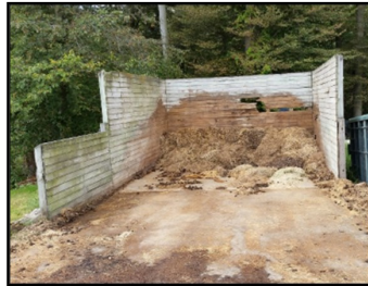
Old manure structure on left and new structure on right.

From left to right: thick growing cover crop on Middletown area farm, stream protected from erosion for landowner in the Greenville area, and a new horse manure storage structure at Carousel Park.