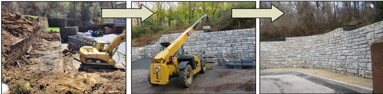
The District administered a contract to demolish a deteriorating timber retaining wall in the Rockland Mills condominium community off Rockland Road. Drainage from up slope and rotting timbers were causing the wall to collapse. An interlocking stone wall was installed to stabilize the embankment.